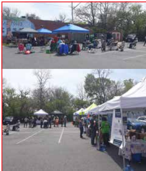
The return of Earth Day

Partnering with Small Things Matter to feed folks in Takoma Park