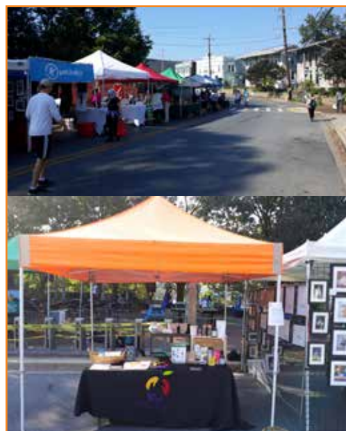
Sponsoring the Crossroads Farmer's Market