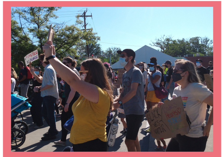
Takoma Park BLM march that began at the Co-op's parking lot

Finally, we continue to carry out our general responsibilities for monitoring the store's operation and finances and reviewing our policies to make sure they are up-to-date.