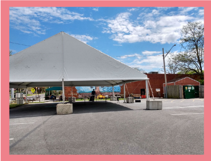
While the store was closed to the public, curbside pick up of online orders occurred under a tent in the parking lot.

Essential. We all spent the spring of this year saying that word a lot. Essential businesses. Essential workers. In a year we were all asked to give up so many aspects of our pre-Covid lives, it put into stark relief the things that we absolutely couldn't live without. In every community throughout this country, and even the world, grocery stores became one of those things that were essential to our lives. The challenges of operating a business throughout this year have been immense, but the response of the entire Co-op community has been incredible.